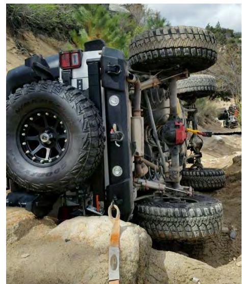
tis the season for rolling.