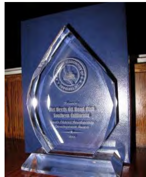
CAL 4 Wheel Drive, new member award