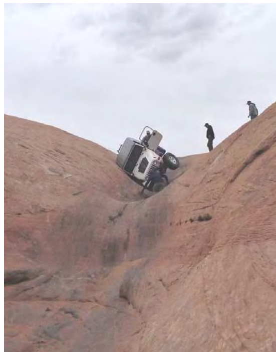
fun in Moab UT