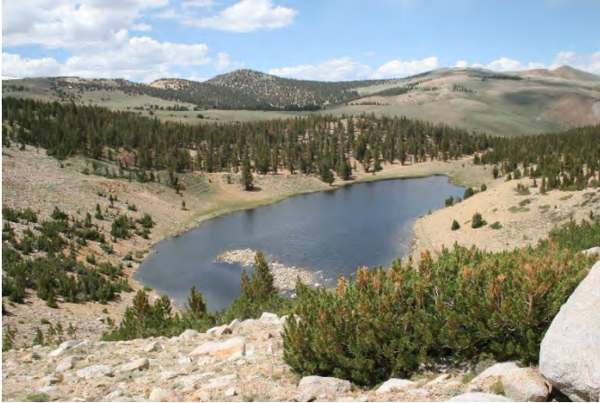
A beautiful Alpine Lake in the High Sierras