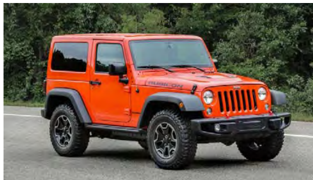
Romantic Rides for Valentine's Day