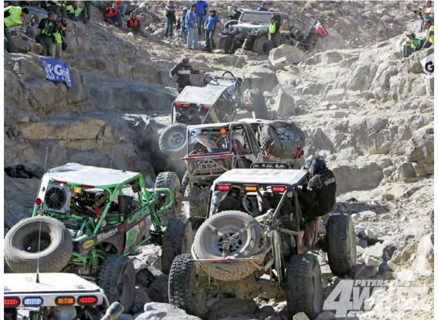
A view of Back Door Trail, only one out of ten rigs make it over the waterfall without winning. I am told that only 10% finish.

I and a few my former dirt bike riding buddies hung out at Brad's place in Johnson Valley, what a great location, after spending the days watching the race we were able to drive back up the hill, enjoy an adult beverage and dinner while looking over the whole valley. Yes, there is a cloud of dust that hangs over the whole valley. The dust cloud does not make it Brad's Place.