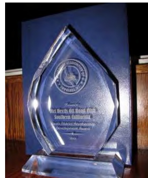
CAL 4 Wheel Drive, new member award