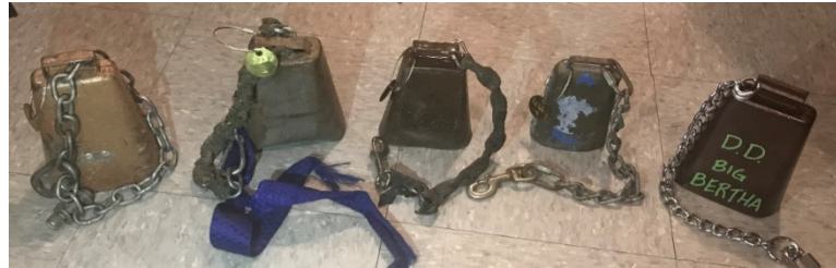
From left to right cowbell 1, 2, 3, 4 and 5