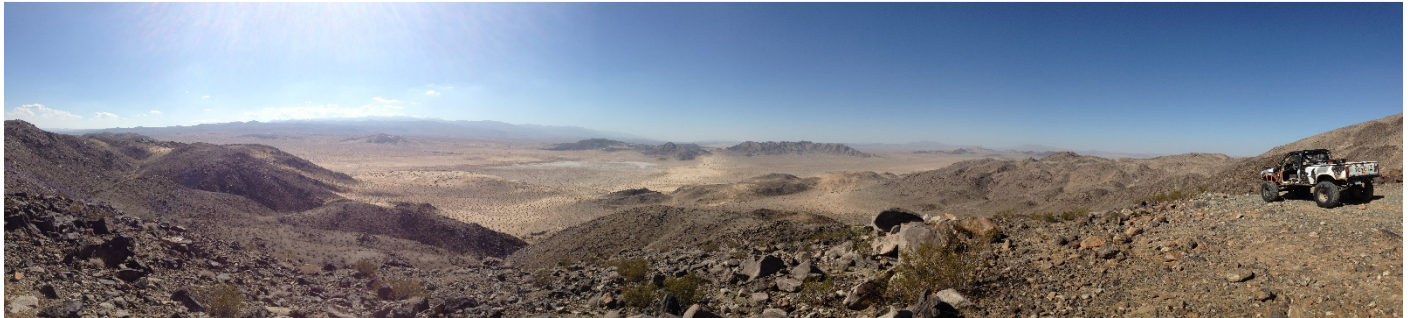
Next day, after it rained 4 inches in 18 hour period October 2018.