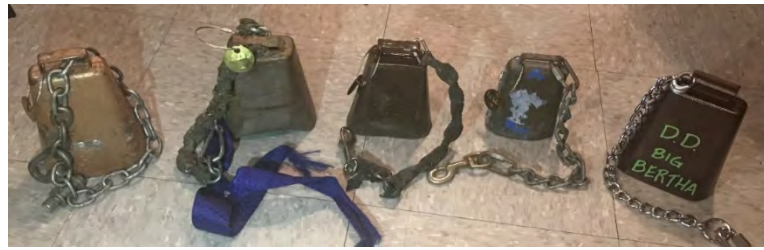
From left to right cowbell 1, 2, 3, 4 and 5