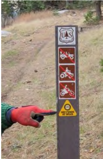
The extremist are on a mission.