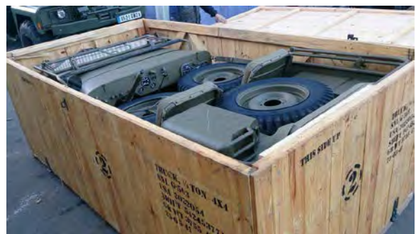
Jeeps on there way to Europe during WW2.