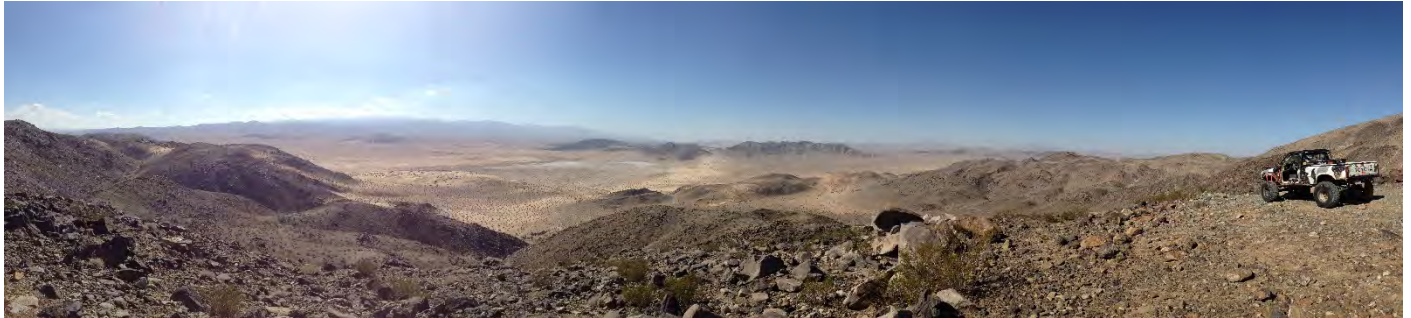
A view of Means wet lake, over an 18 hour period it rained 4 inches, October 2018.