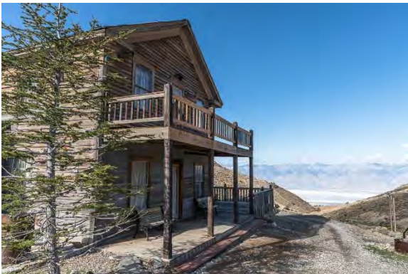
California Hotel in Cerro Gordo. You can own it.

https://boingboing.net/2018/06/11/for-sale-1-california-ghost.html