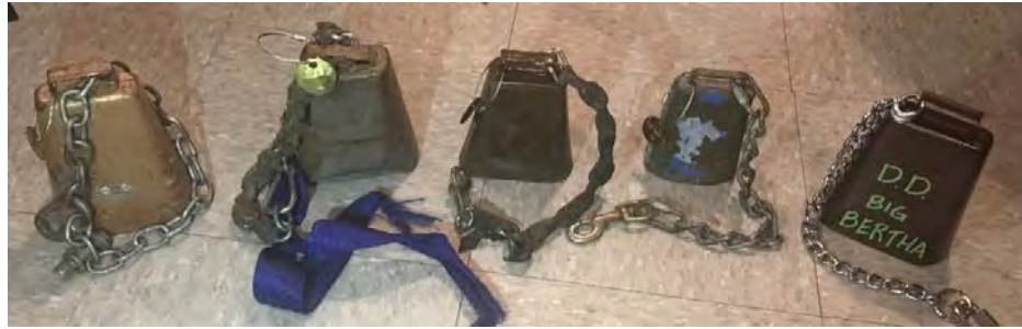
From left to right cowbell 1, 2, 3, 4 and 5