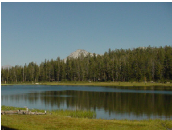
Beautiful High Sierra Lakes