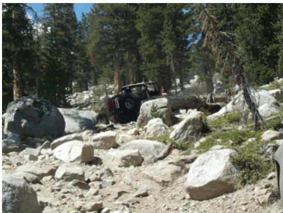
Rocks cover most of the trail

Trail Boss: Ron Webber ronjp@outlook.com Home 714 649 9836 / Cell 714 715 5692