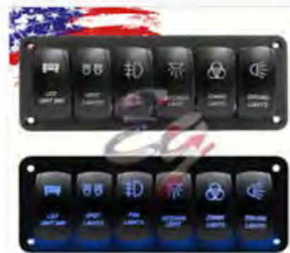
6 Bay Switch bank.

Even with the pre-made switches you will still need to run your wiring, so really you're paying for the bank and the control box, both of which can be built by you with a little work in the evening on your part. I have found a water tight fuse bank with 5 relays and fuses on eBay, it is going for $115.00, but I want a 6-bank block for this install and I want it on the cheap. I kept looking and found a Mazda fuse box for $50.00, I have to look into it more, but it might just work perfect for my needs, more to come on that.