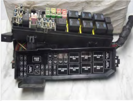
OEM 01-04 Mazda Tribute/ Ford Escape Fuse and Relay Junction Box.

So let's get that old soldering iron out and let's make this switch box for our rigs.