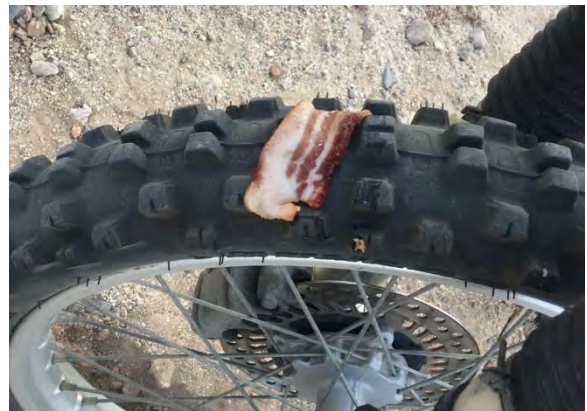
Breakfast in the desert.

Joe and I convoyed up Friday and met Pete at Whiskey Pete's where we had dinner. The rooms were newly upgraded and quite nice and comfortable. Of course, the unusual noises always corrupt my sleep. Saturday morning, we rendezvoused for a fine breakfast in the desert.