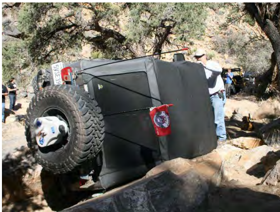
Proud owner of a cowbell.

Review next year's calendar and making your plans.