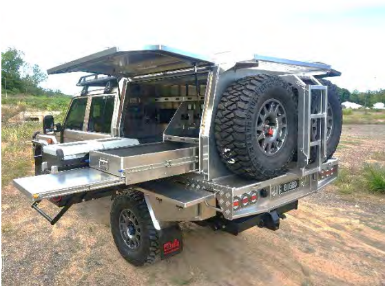
don't leave home without it.