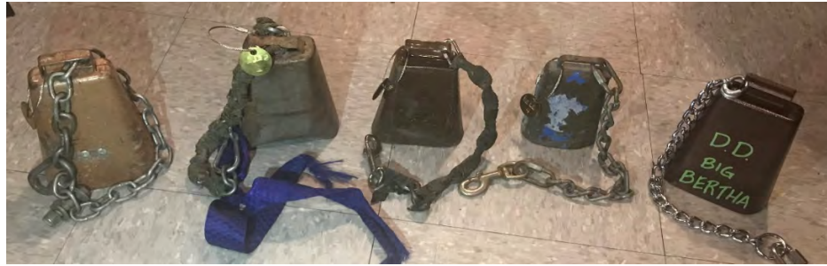
From left to right cowbell 1, 2, 3, 4 and 5