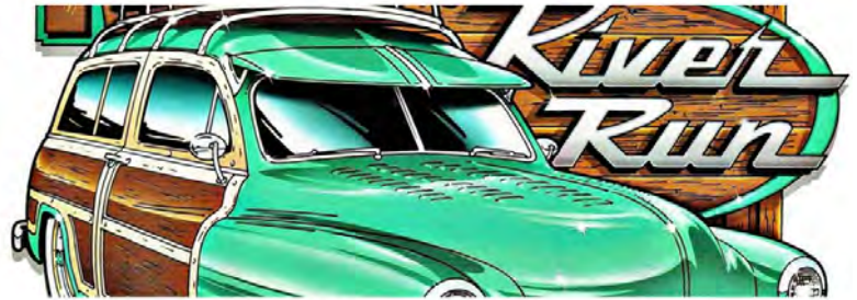
Rod Run - Kick Back in Kernville