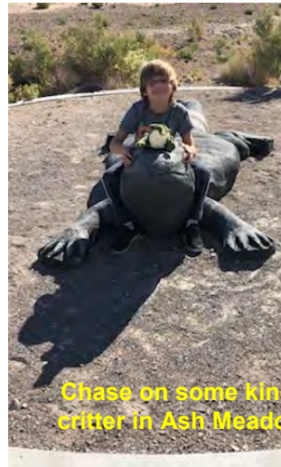
Chase on some kind of critter in Ash Meadows.