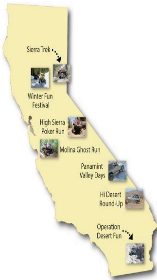
C4WDC Event Map