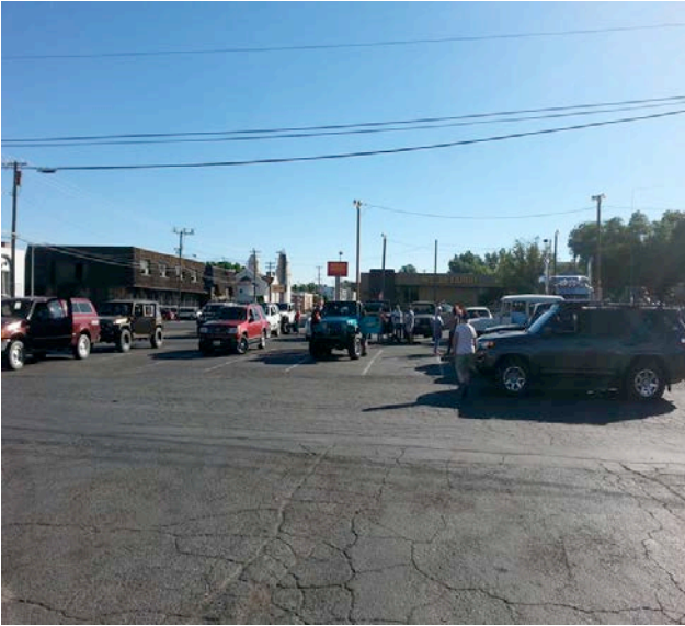
Starting From Winnamucca, Nevada