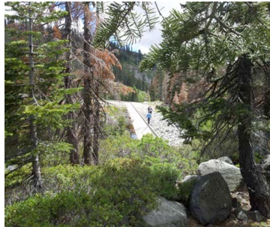
Three Lakes Dam