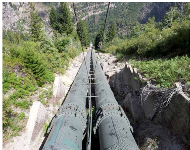
Feather River Canyon View 2