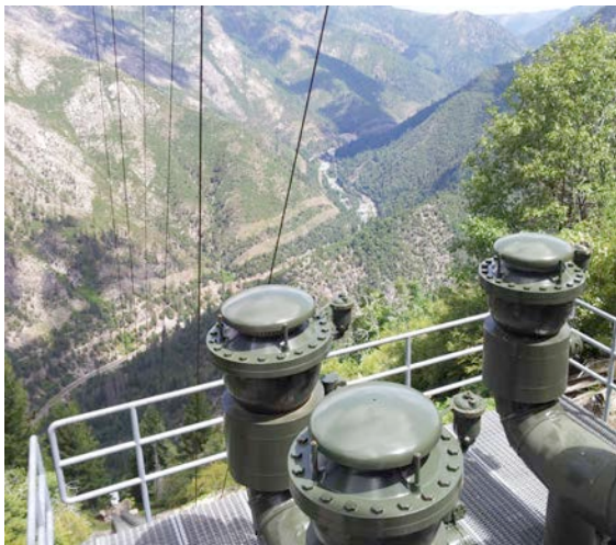
Feather River Canyon View 1