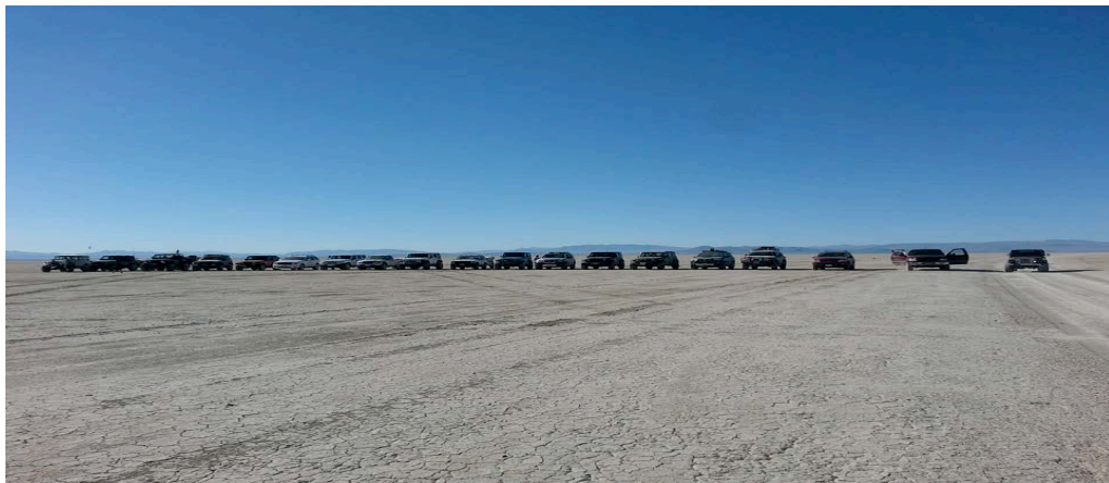
Line Up on the Playa